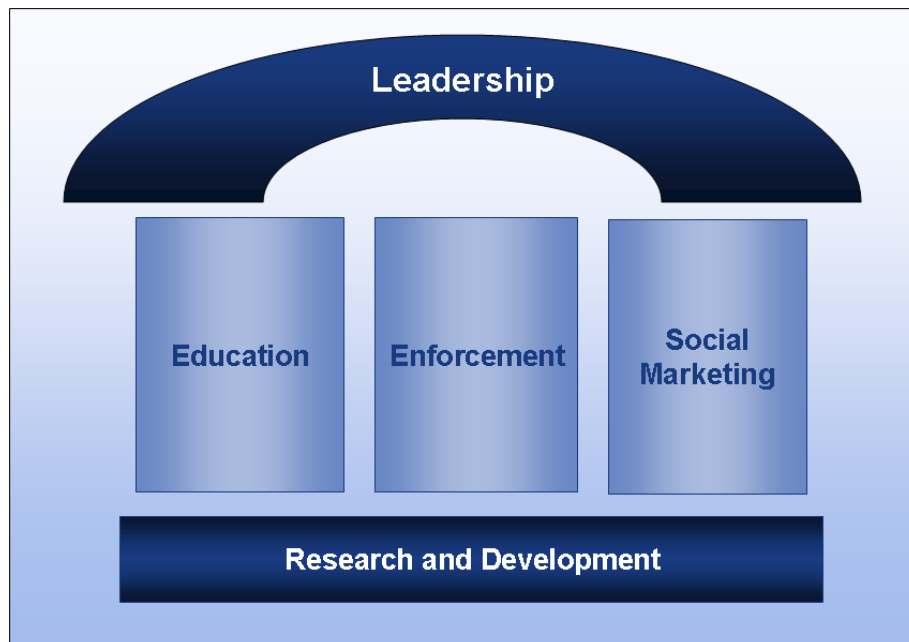
Figure 2: Illustration of National Campaign Strategic Framework

Figure 2 illustrates a possibility for a strategic framework for the National Campaign. The framework has three main substantive components: